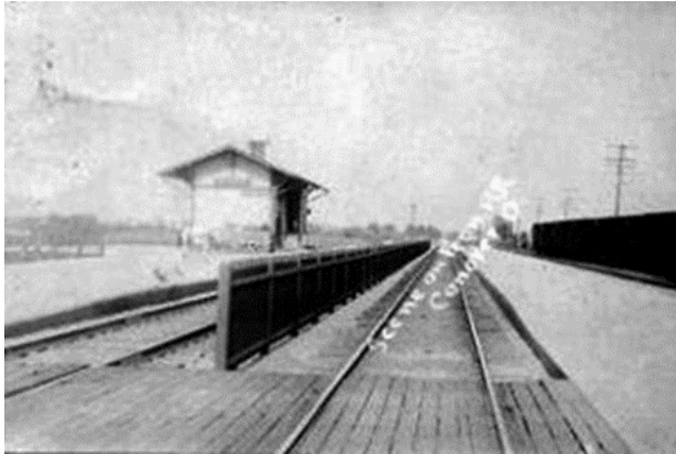
PCC & St. Louis Railroad, Conover, Ohio

So, where did my addiction to photographing trains come from anyway?