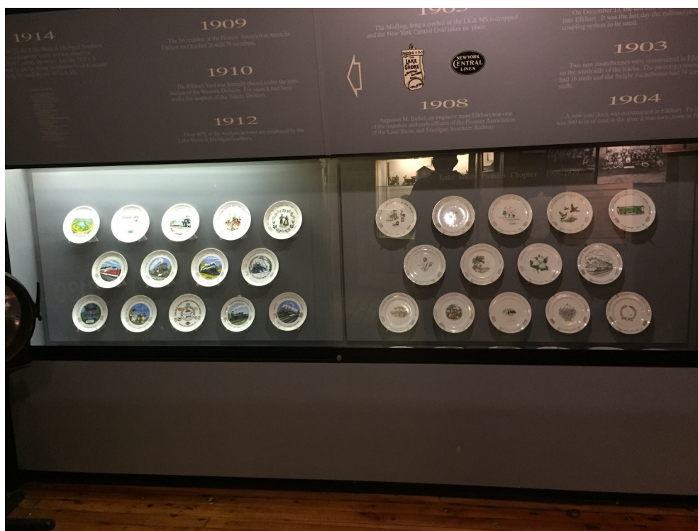
NYC Railway Museum, Railroad China Display, Elkhart, IN.

Congress requires Class I railroads and entities providing regularly scheduled intercity or commuter rail passenger transportation to implement PTC systems by Dec. 31, 2018. Only if some key implementation and installation milestones are met may railroads be eligible to obtain a limited extension to complete certain non-hardware, operational aspects of PTC system implementation no later than Dec. 31, 2020, subject to the Secretary of Transportation's approval.