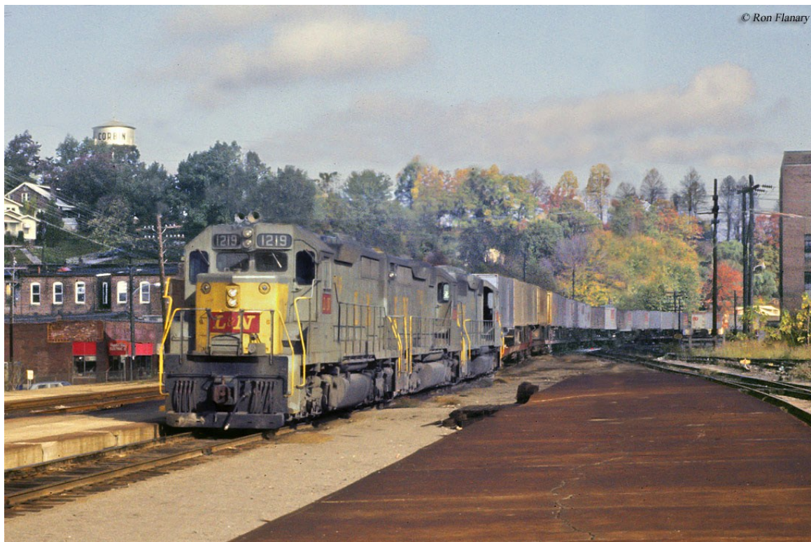
This shot appears to be a southbound piggyback coming into Corbin. The water tower has been updated along with the track.