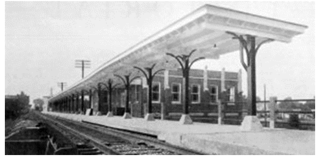
L&N Depot, Madisonville, Ky