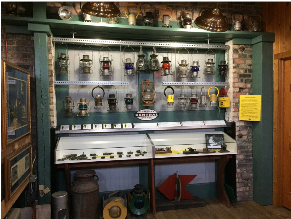
NYC Railway Museum, Elkhart, IN.