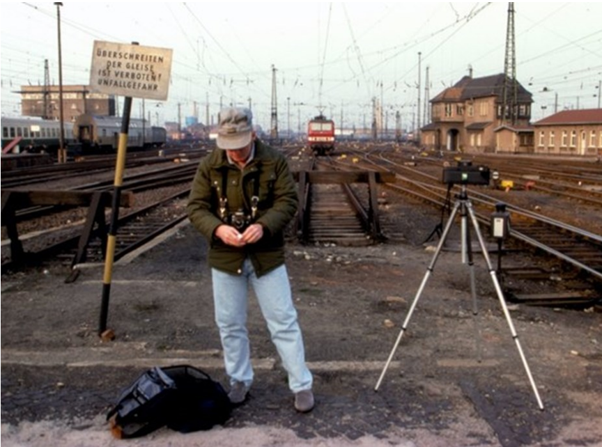
Me changing film at Leipzig, East Germany during an photo assignment in the area after the fall of the Eastern Block walls and fences.