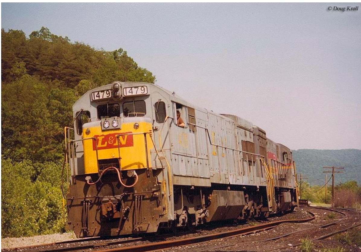
Ricky Bivins sent this photo of what looks to be a coal drag at Barboursville, WV.